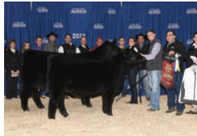
DAM AND GRANDDAM

Consigned by Hollinger Land & Cattle and Nu-Horizon Angus