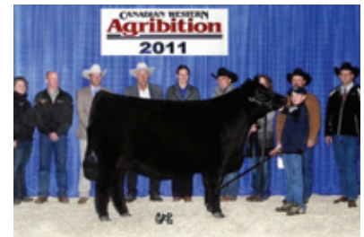
JEN 527S FAY 106X • GRANDDAM