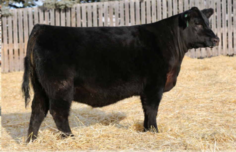
HF MISS BLACKCAP 288H • PURCHASED BY IRIS CREEK FARMS FOR $10 000