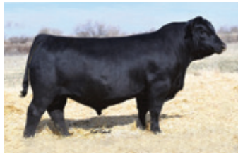
SITZ PROFOUND 680G