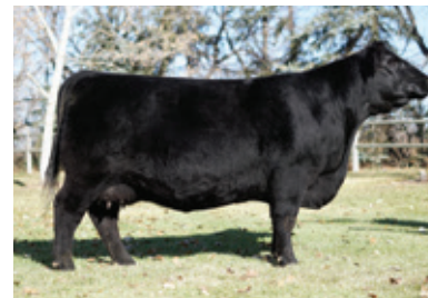
CCCJ BEAUTY 4B • DAM