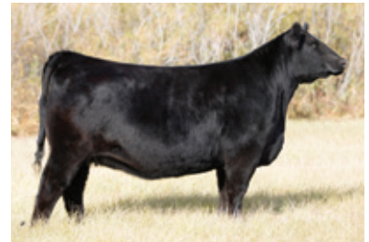
HOFFMAN HIGH ROSE 7069 • DAM