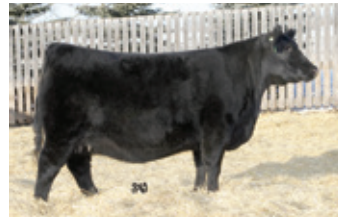
DAMS LIKE THESE...ARE SOME OF THE MOTHERS