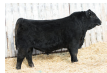
JL HOMEGROWN 0131 • $71,000 JL HIGH SELLING BULL