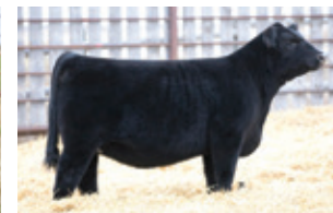
HLC EVENING TINGE 723H • EXPRESS DAUGHTER