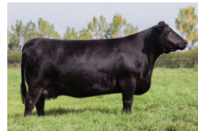
RP BLACK LICORICE RLP 28J • DAM