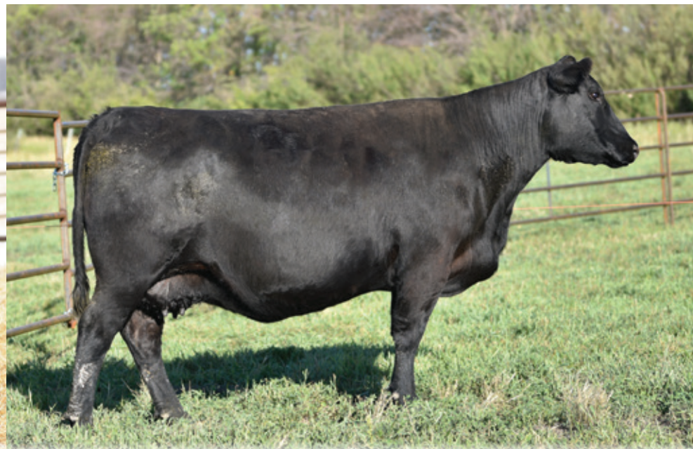
D • JL CASSIE 6094 • S A V RENOWN 3439 X JL CASSIE 0437