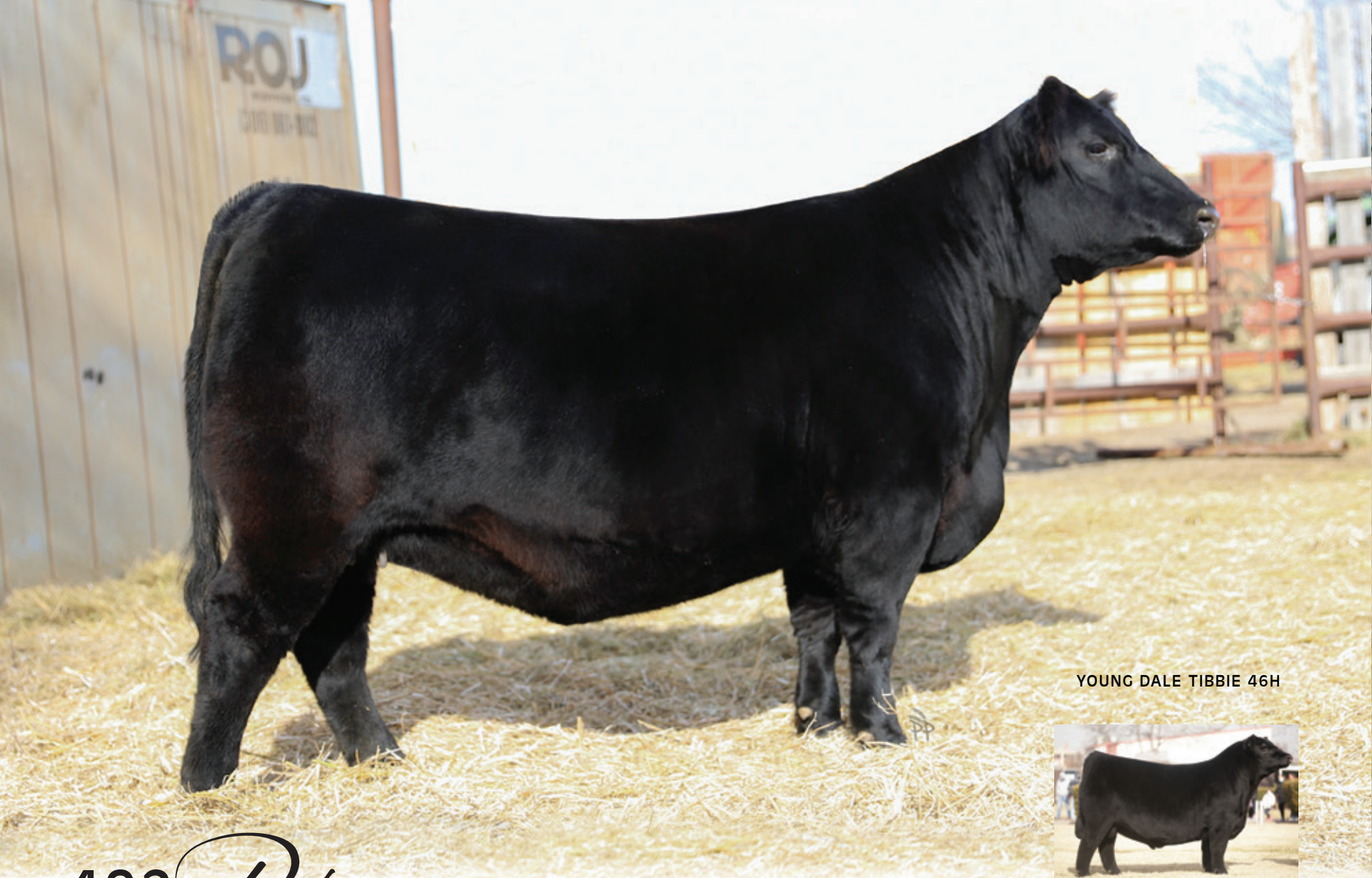
YOUNG DALE TIBBIE 46H