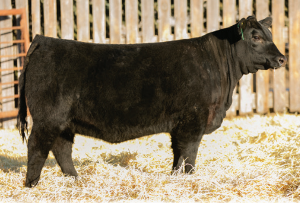
HF TIBBIE 125H • PURCHASED BY GRAND RIVER ANGUS FOR $15 500