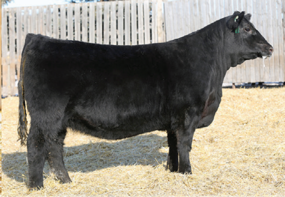
HF EVENING TINGE 1F • PURCHASED BY MWC INVESTMENTS FOR $25 000