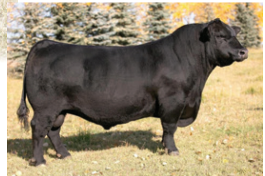
SCHIEFELBEIN SHOWMAN 338 • SIRE