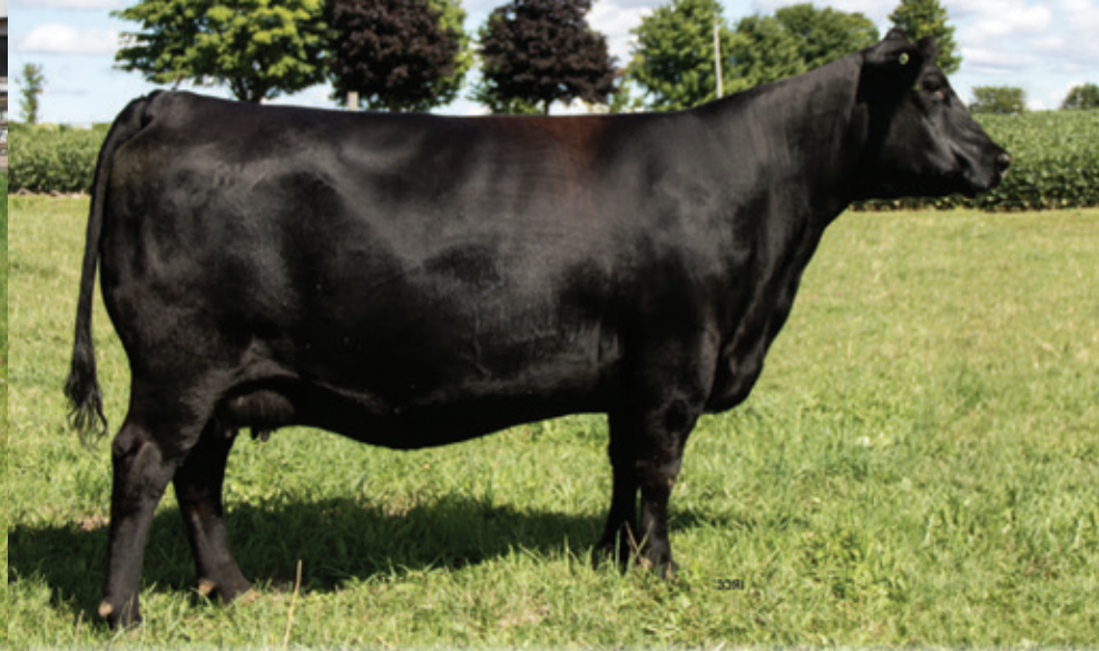
B • GILCO VELVET 3A • MCTL PURE PRODUCT 903-55 X MILLENIUM VELVET