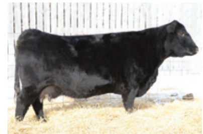
ENCHANTRESS 229S • GRANDDAM