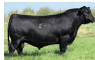
COLEMAN TRIUMPH 9145 • FULL BROTHER TO CHLOE 900