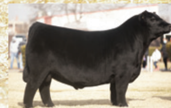
HILL VALLEY RECKONING 931 - SERVICE SIRE