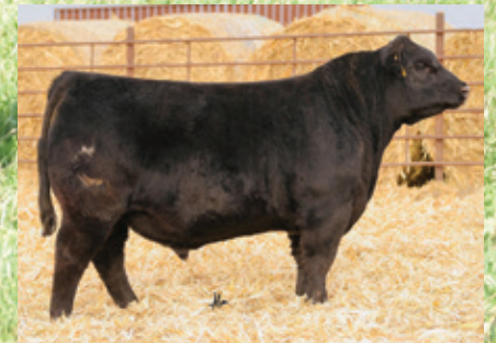
POSS DEADWOOD • $900,000 FEATURE