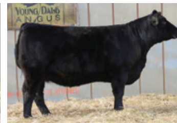
YOUNG DALE COUNTESS 53H