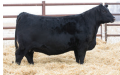
KARAMA 922G • PICTURED AS A BRED

Guarantee of 6 embryos. Purchaser can do either an IVF or conventional flush. To be conducted at Bow valley Genetics Consigned by J Square S Angus & GT Angus