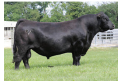
DEER VALLEY GROWTH FUND • SIRE