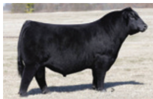
CONLEY EXPRESS 7211 • SIRE OF EMBRYOS