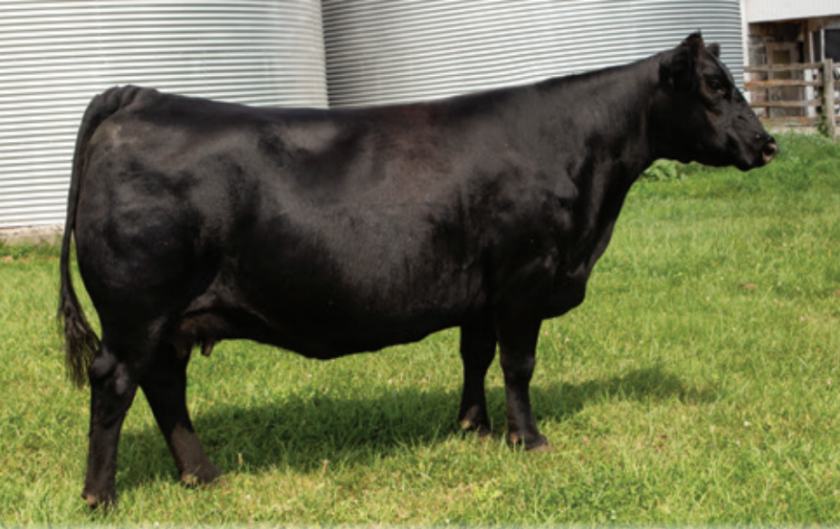
A • GILCO VELVET 1B • S A V NET WORTH 4200 X MILLENIUM VELVET