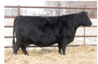
BROOKMORE KARAMA 204X • DAM