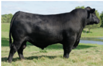
SCHEIFELBEIN SHOWMAN 338