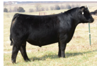
MAY-WAY PLAY IT SAFE • SIRE