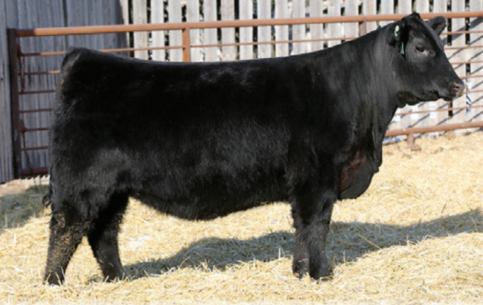
HF MISS BLACKCAP 107F • PURCHASED BY KYLIE SIBBALD AND GOLDEN OAK LIVESTOCK FOR $25 000