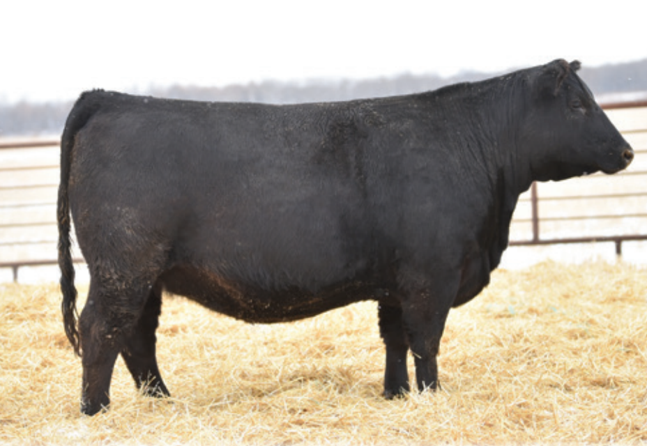
C • JL FLOESSA 9028 • S A V PRESIDENT 6847 X LFE BA FLOESSA 97A