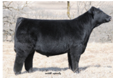
WWSC SLIDER • SIRE