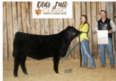
CHAMPION INTERMEDIATE HEIFER CALF