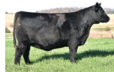
CF TIBBIE 440H • MATERNAL SISTER TO PREGNANCY

Pregnant recip due February 27, 2022. Consigned by Gilchrist Farms