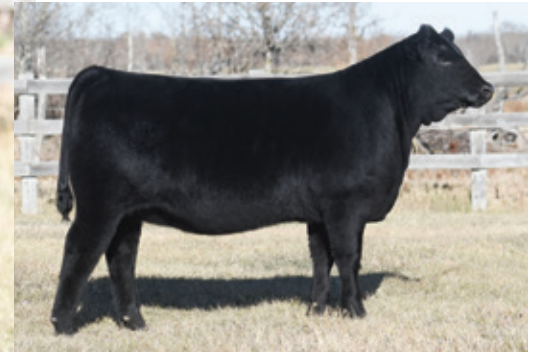
BAR-E-L BRIDE 89J • BAR-E-L BRIDE 28C'S 2021 HEIFER CALF