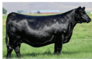
COLEMAN CHLOE 9275 • FULL SISTER TO CHLOE 900

Embryos are exportable, housed at Trans Ova Genetics Consigned by La Conquista Ranches