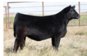
HLC PONDEROSA BLACKBIRD 574G • DAUGHTER OF 136A