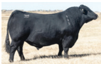
HF ALCATRAZ 60F