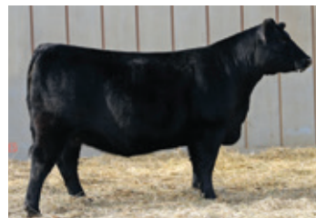
YOUNG DALE ALLEGRA 24H