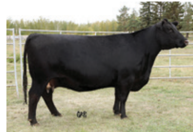
EXAR BLACKCAP 1177 • DAM