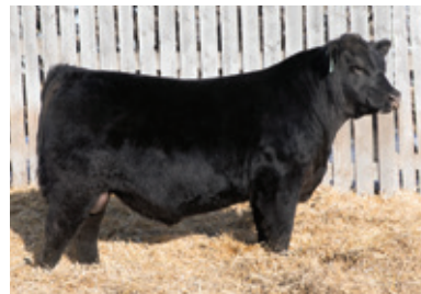
J SQUARE S PRAIRIE GOLD 989G • SIRE